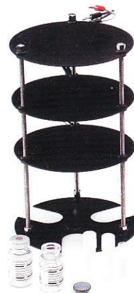
Shelf Rack, 3 level platform with heating elements

Freeze Drying Glassware 50ml / 150ml / 300ml