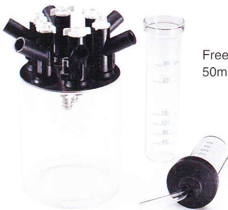
Hedgehog with perspex drum

Freeze Drying Glassware 50ml / 150ml / 300ml